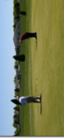
9 Hole Executive Golf Course